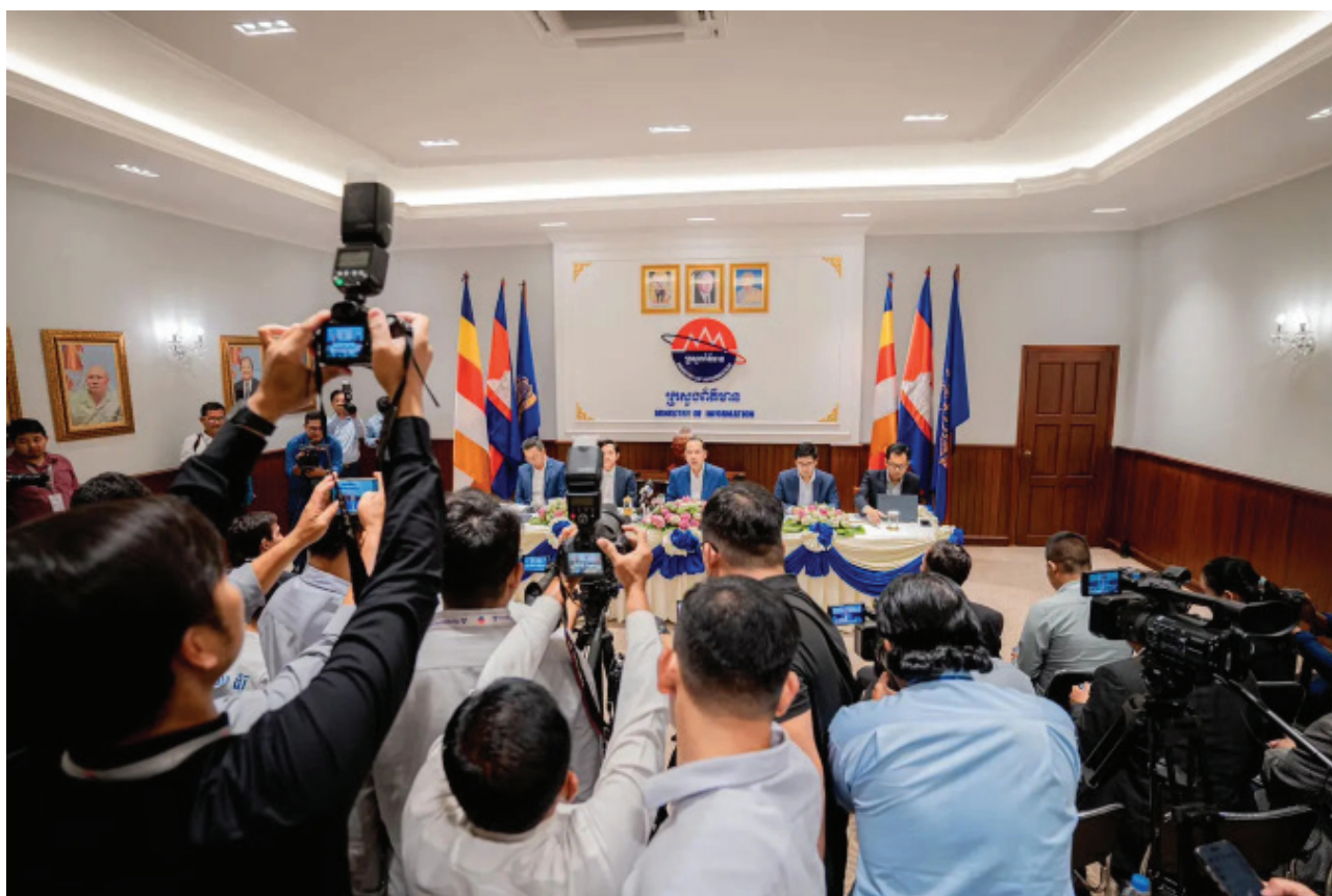
Information Minister Neth Pheaktra speaks at a press conference to launch the Charter for Professional Journalism on August 6, 2024, a photo post on the Ministry of Information's Facebook.

The Charter for Professional Journalism officially launched on August 6, 2024, after the ministry made the Charter public on July 24, 2024.