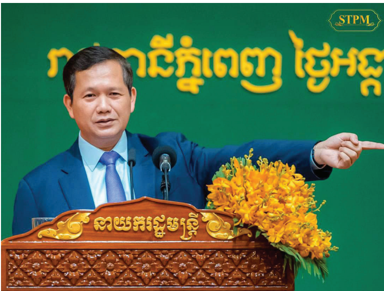
Prime Minister Hun Manet.

On December 21, 2023, in a letter sent to the 20th Editor Forum under the topic “Media professionalism and ethics,” Prime Minister Hun Manet expressed the important role of the media sector and journalists’ work but stressed the poor professionalism and journalistic ethics in the country, especially among online journalists. Manet said there needs to be more attention drawn to public trust.