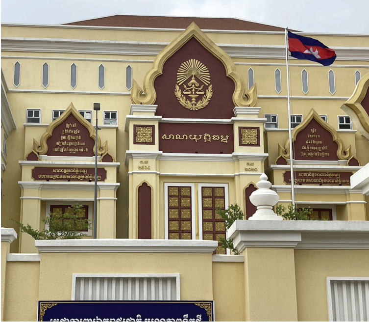
The Cambodia justice hall which houses the Court of Appeal and Phnom Penh Municipal Court.