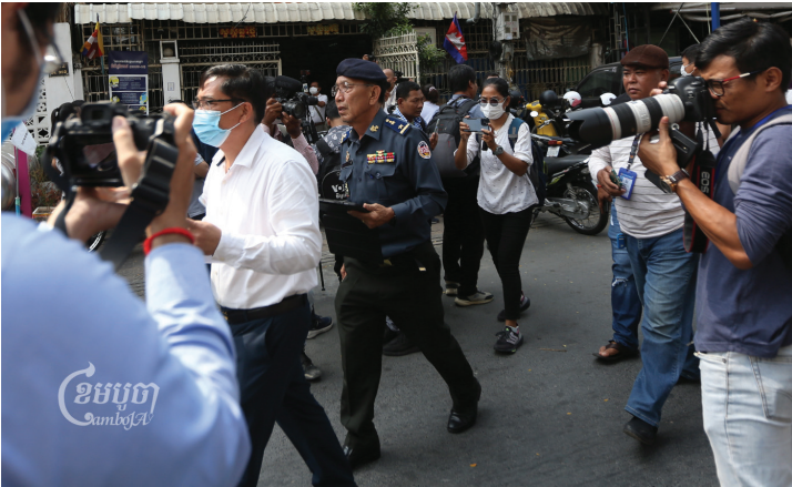
Journalists taking picture of police in front of VOD's office on Feb 13, 2023 as the media outlet was closed down.

On February, 13, 2023 the government decided to shut down Voice of Democracy (VOD), after then-Prime Minister Hun Sen demanded an apology and retraction of a report stating that his son, Hun Manet, had signed off on aid to Turkey.