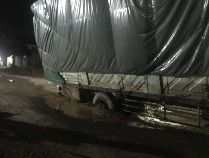
Overloaded truck stuck in mud on the road in the center of Battambang city on Oct 23, 2023.